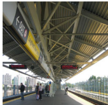
Lougheed Town Centre SkyTrain station

Parks are also in ready supply in this quiet, unassuming neighbourhood. There's Burquitlam Park, Cameron Park, Stoney Creek Park, and Cottonwood Park (just across the street at the end of the block from the Black + Whites on Foster Avenue). There's Mountainview Park, Blue Mountain Park, Hume Park, and just on the eastern edge of the neighborhood is Como Lake Park famous for its fishing, playground and picnic areas. There's also a nice 1-kilometer trail that loops around the picturesque little lake.